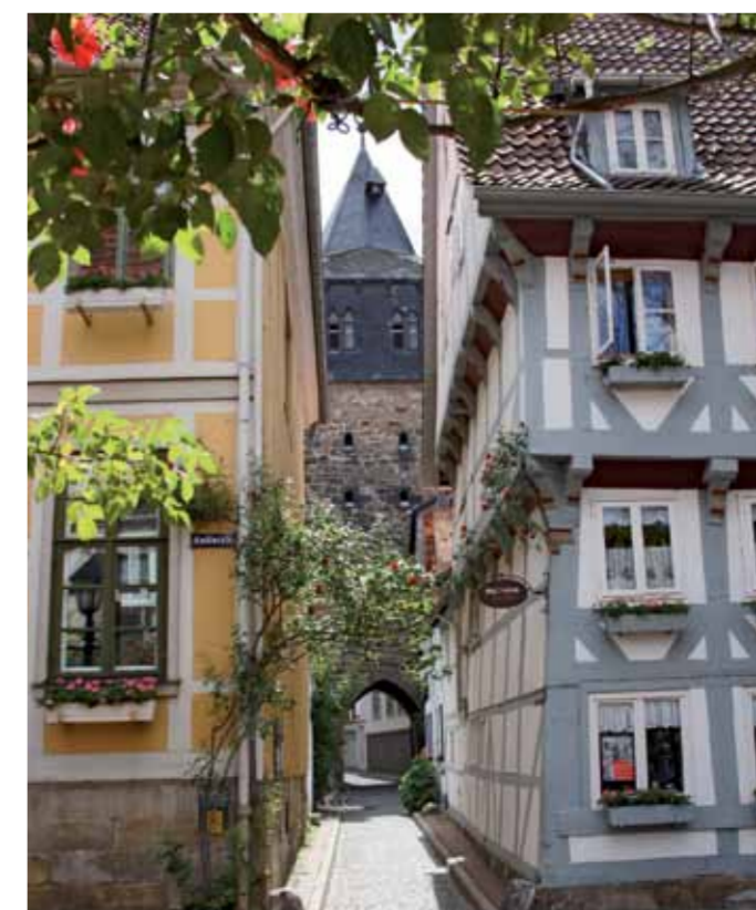
PHOTO BOTTOM 'Kehrwieder' tower in the half-timbered district

Quick national connections are guaranteed by the ICE trains. Hildesheim can be reached directly via ICE, for example, from Berlin, Braunschweig, Frankfurt am Main, Göttingen, Munich and Stuttgart. Other nationwide connections are available with German Rail ('Deutsche Bahn'), 'Erixx' and 'NordWestBahn'.