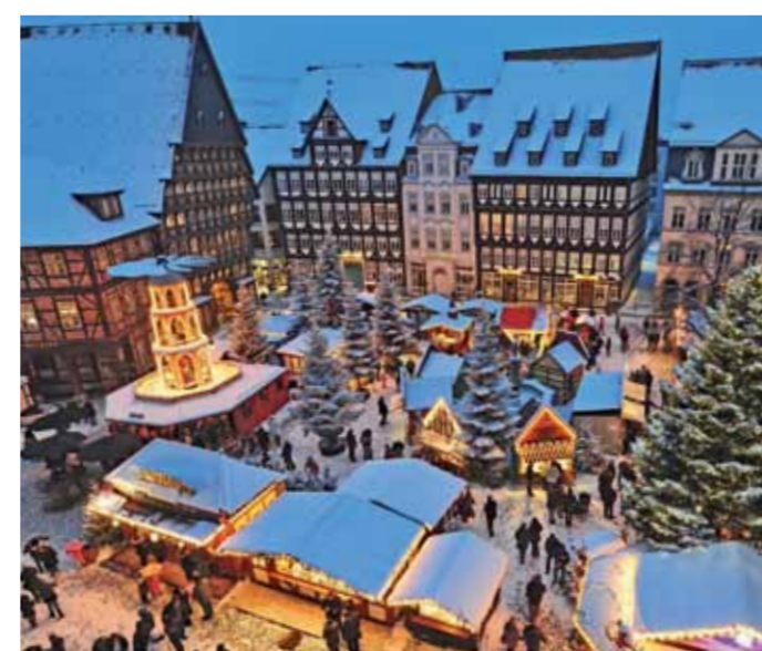
PHOTO BOTTOM LEFT Christmas market in Hildesheim PHOTO BOTTOM Hezilo chandelier in St. Mary's Cathedral