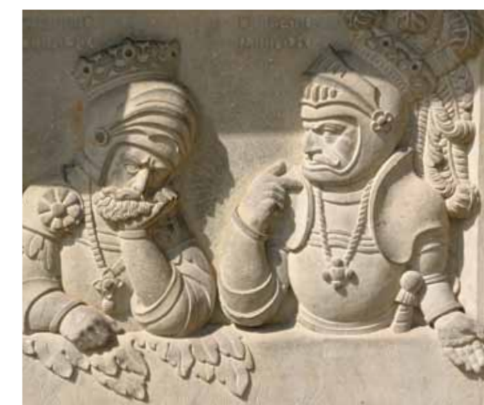
PHOTO TOP 1000-year-old rosebush at the apse of St. Mary's Cathedral PHOTO BOTTOM Detail shot of the fountain on the market square